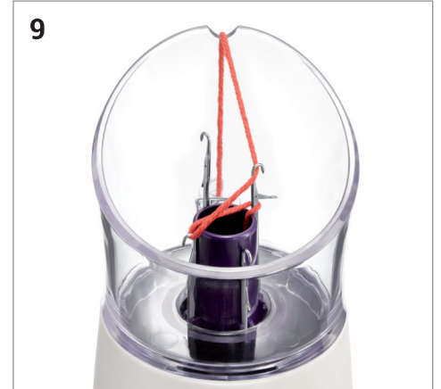
9 Now start one full round, catching yarn in every hook.