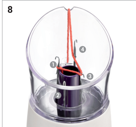
8 Skip the fourth hook.