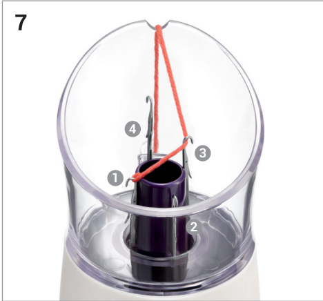
7 Place yarn in third hook. Turn handle slowly.