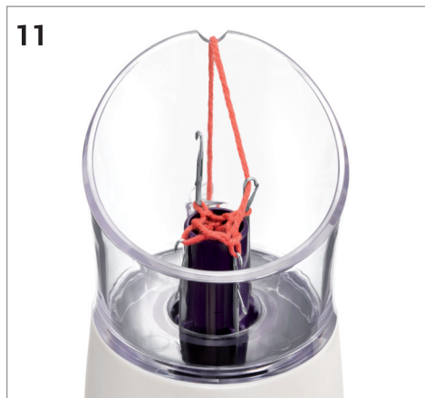
11 Work slowly until first full round is complete.