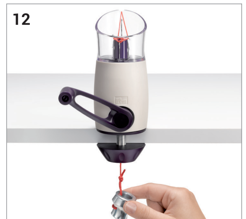
12 Tie weight to yarn end.